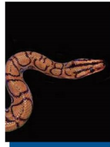
Pele (Brazilian Rainbow Boa)