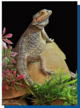
Sebasclus (Bearded Dragon)