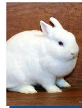
Lola (Domestic Rabbit)