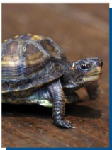
Roger (Baby Eastern Box Turtle)