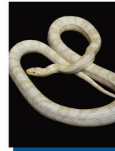
Athena (Albino Corn Snake)